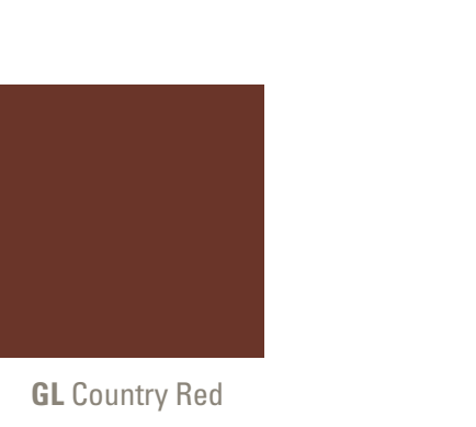
The colours on the chart are merely samples. Actual product colour may vary slightly depending on the application technique, surface, and production year. Our coloured PVC samples remain the best indicator of the true final product colour.